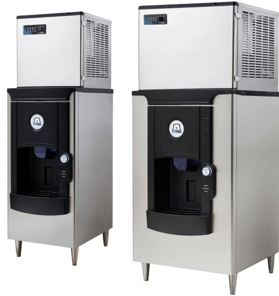
ID-H150-22 shown with IM-0550-AH-22 ID-H250-30 shown with IM-0550-AH (Ice machine sold separately)